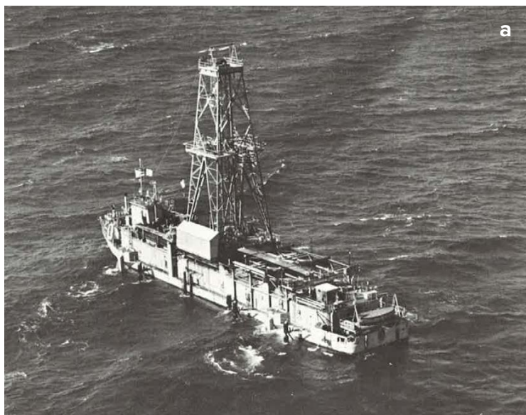
FIGURE 1. (a) The drilling vessel CUSS I as used during phase 1 of Project Mohole. (b) A first examination of cores onboard ship during Project Mohole.

drilling barge CUSS I (Figure 1a), to which four large outboard motors had been added so it could operate as the first dynamically positioned drilling vessel in the world (Bascom, 1961). In a successful demonstration, phase I cored 170 m of sediments and 13 m of underlying basalt at a deepwater site offshore Baja California (Figure 1b). Huge public interest developed, thanks to a prominent article by the famous novelist John Steinbeck in Life magazine (Steinbeck, 1961). Recovering subseafloor basalt was a major scientific accomplishment at the time, so much so that it inspired a congratulatory telegram from US President John F. Kennedy